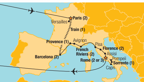
Number of overnight stays in parentheses. This tour may also be reversed.