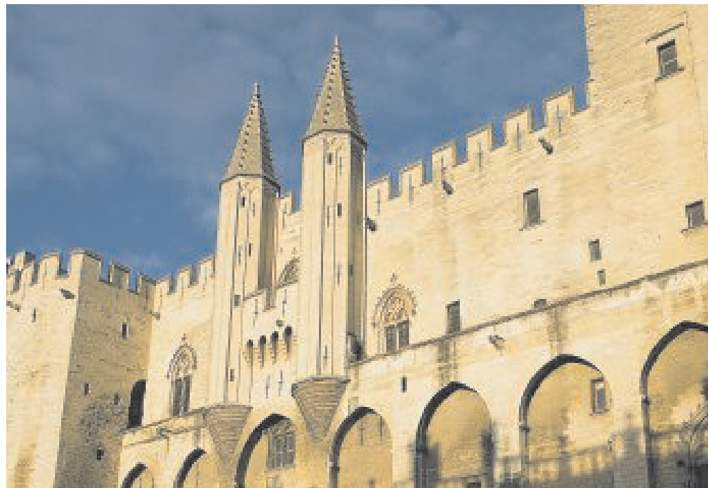
Pope Clement V and six successive popes resided in the Palais des Papes at Avignon.

Excursion to Monaco • Follow the coastline of the Riviera to Monaco, a tiny principality that packs wealth, royalty and the world's most famous casino into just 0.8 square miles. The Grimaldi family has ruled Monaco since 1297, making them the longest-reigning family dynasty in Europe. See the royal palace and pass by the Cathédrale de Monaco, site of Prince