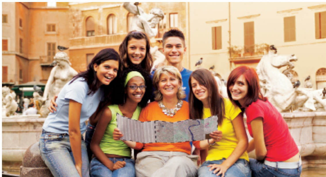
When in Rome, you will be greeted by impressive sights at every turn.